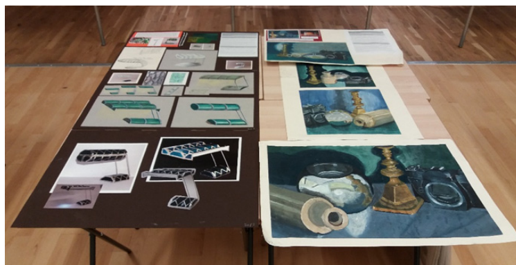
A display of excellent artwork by a Kirkwall Grammar School student from the Isles

I was lucky to be in town on the day of the Kirkwall Grammar School Art Exhibition, at which the work of those taking National 5, Higher and Advanced Higher art & design was on display. It demonstrated an impressive array of talent.